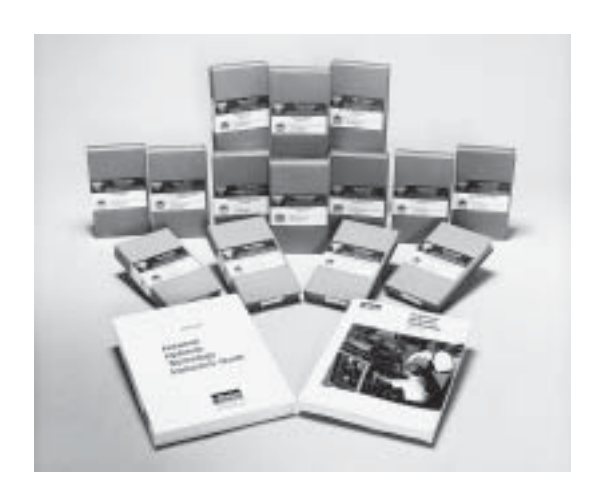
Industrial Hydraulic Technology 14 Video Tapes, 1 Textbook, 1 Instructor's Guide