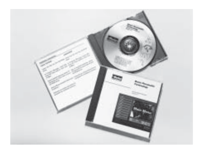
Basic Pneumatic Technology CD-ROM Bulletin 0298-P4

The pneumatic Video Training Library consists of 4 video tapes on pneumatic systems, compressed air, air preparation and pneumatic directional control valves. Available as a set or individually.