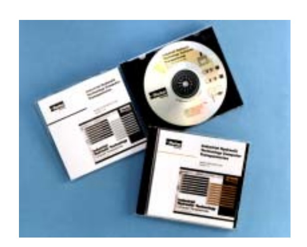
IHT Computer Transparencies Bulletin 0232-B3/CD

With years of product expertise and worldwide resources, Parker has developed the Basic Pneumatic Technology CD. It is the equivalent of countless textbooks, videos and classroom lectures covering the subject of basic pneumatic components and systems technology. Using the latest computer based training techniques, along with state-of-the-art animated and video motion visuals, Basic Pneumatic Technology is designed to maximize information retention while reducing student's time and related educational expenses.